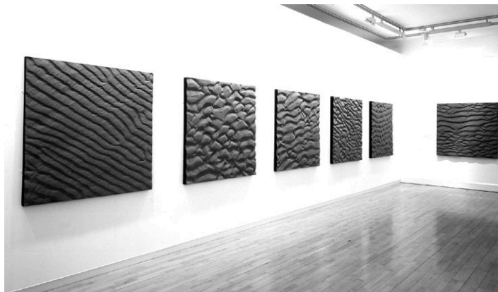
Sand, Wind and Tide series (1969)